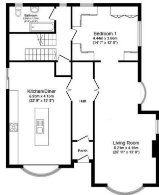
Ground Floor Floor area 103.6 sq.m. (1,115 sq.ft.)